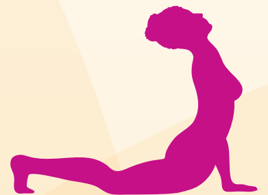
UPWARD FACING DOG