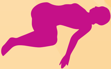
RECLINING SPINAL TWIST