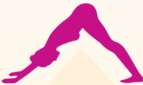
DOWNWARD FACING DOG